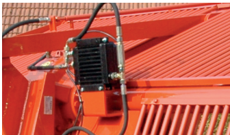
Option: Oil cooler