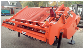
Can be equipped with a rotary cultivator.