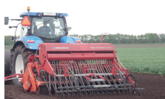
Combination with sowing machine and top-mounted lift