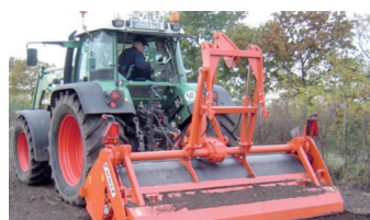
Option: Top-mounted lift