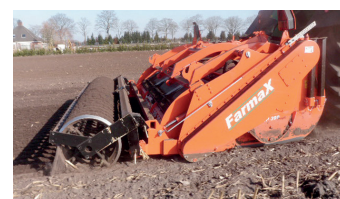
Option: A second roller