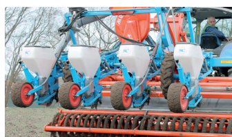
Sowing machine in top-mounted lift