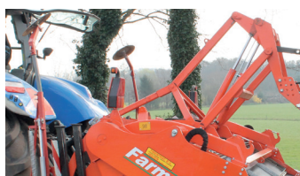
Option: With top-mounted lift